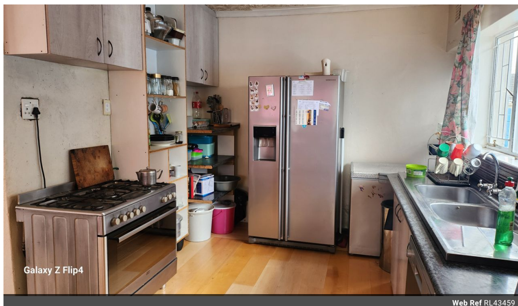
Galaxy Z Flip4